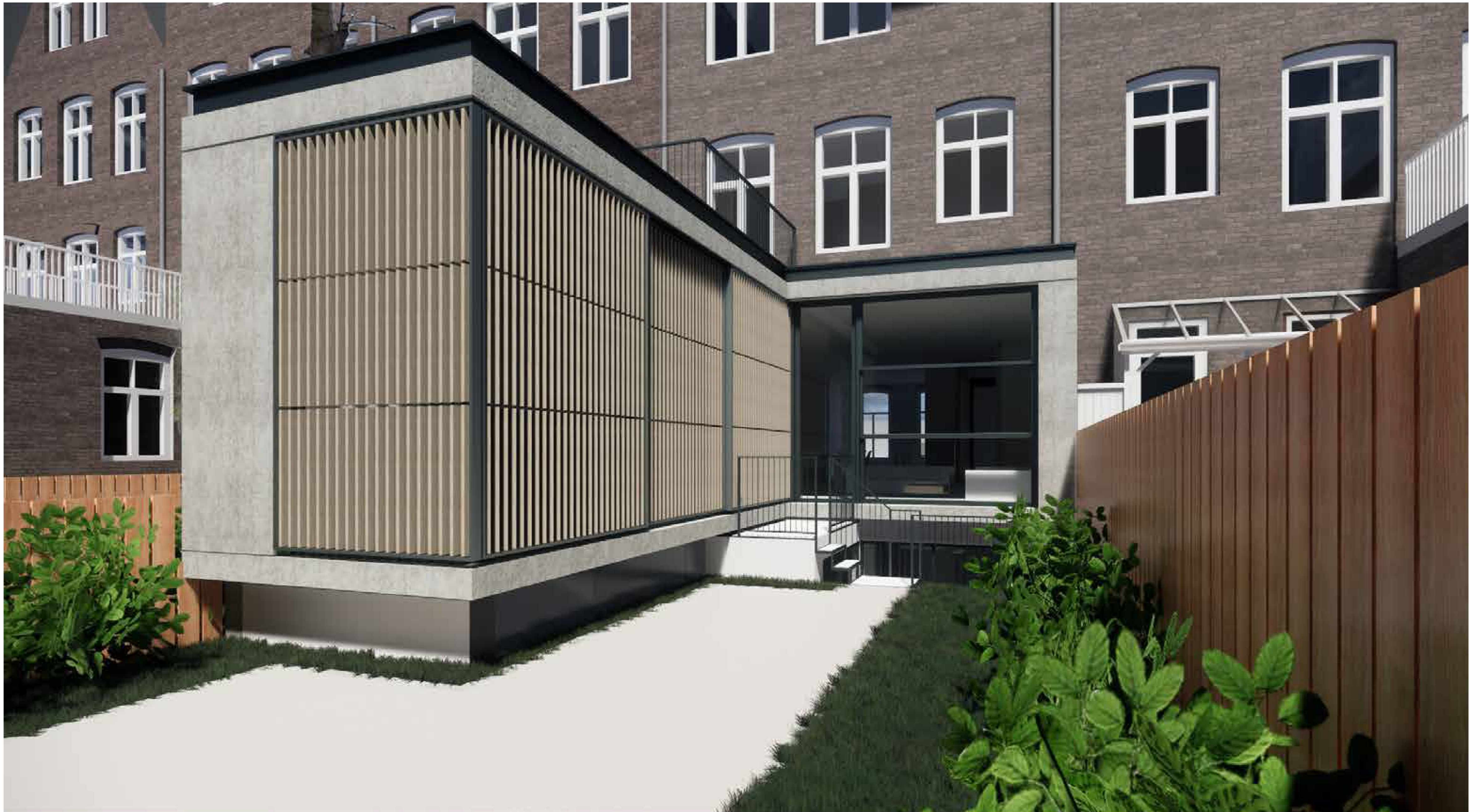
View from EH107 garden