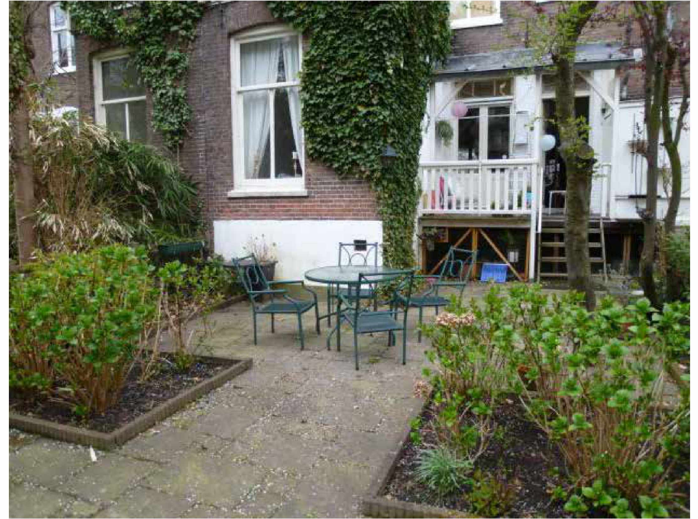
SITE: EERSTE HELMERSSTRAAT 107