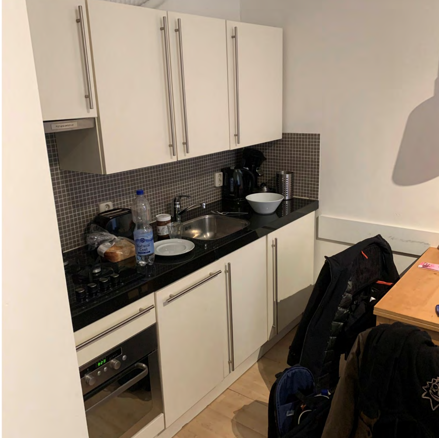
Keukenblok in de woonkamer